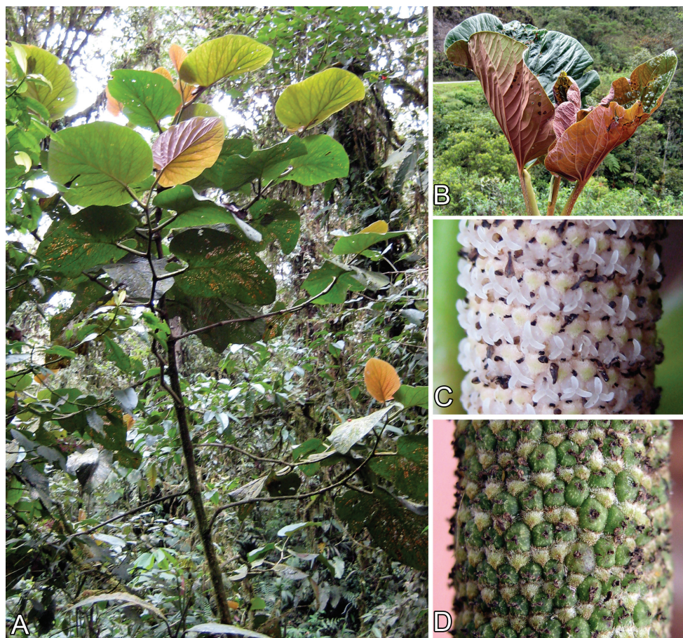
Figure 2. Piper kelleyi . A Habit B Close-up of leaves showing characteristic red color of younger leaves [Tepe et al. 2381] C Close-up of inflorescence [Tepe et al. 2615] D Close-up of infructescence [Tepe et al. 1597].

Piper kelleyi exhibits the third of these patterns. He established the herbarium (MESA) at Colorado Mesa University, Grand Junction, Colorado (CMU), and cultivated a high diversity of Piper species at the CMU greenhouse, including P. kelleyi . These plants are still used for research today.