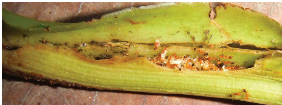
Figure 5. A colony of Pheidole ants nesting inside a petiole of P. kelleyi .

The parasitism rate for all of the Eois collected from P. kelleyi was 8.63%. Parasitic wasps were the most frequent and included Eulophidae (Hymenoptera: Chalcidoidea) at 3.5%, followed by Braconidae (Microgastrine) at 2.7%, and Ichneumonidae at 1.5%. Tachinid flies (Diptera: Tachinidae) had the lowest parasitism rate at 0.9%. Within the subfamily Microgastrine (Braconidae), species of the genera Cotesia (Cameron), Glyptapanteles (Ashmead), Mesochorus (Gravenhorst), Parapanteles (Ashmead), and Protopanteles (Ashmead) have been reared out of the Eois species feeding on P. kelleyi . The determined Tachinid species include Erythromelana abdominalis (Townsend), E. cryptica (Inclán & Stireman), and E. jaena (Townsend) (Inclán–Luna 2010, Dyer et al. 2013, Inclán–Luna and Stireman 2013).